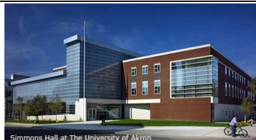
Simmons Hall at The University of Akron

Fall & Spring Office Hours: Monday: 8 a.m.-7 p.m. Tuesday-Friday: 8 a.m.-5 p.m.