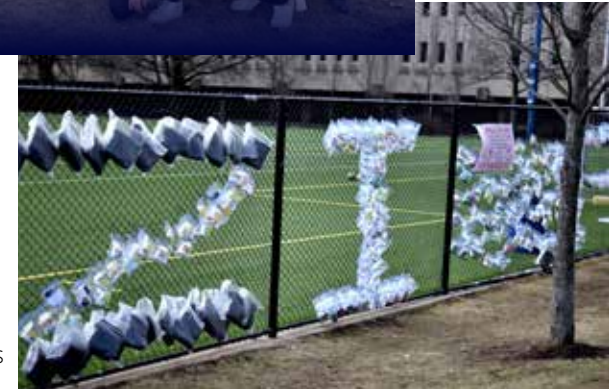
Above: Students coordinate a "Wall of Love" with free personal care items.

To learn more about its work, follow the office on Instagram @serveAkron