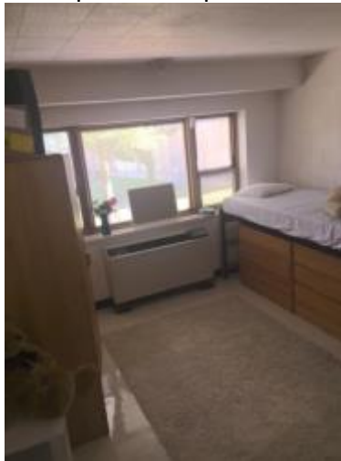
Figure 1: Junior Lofted Bed (Standard set-up prior to arrival)