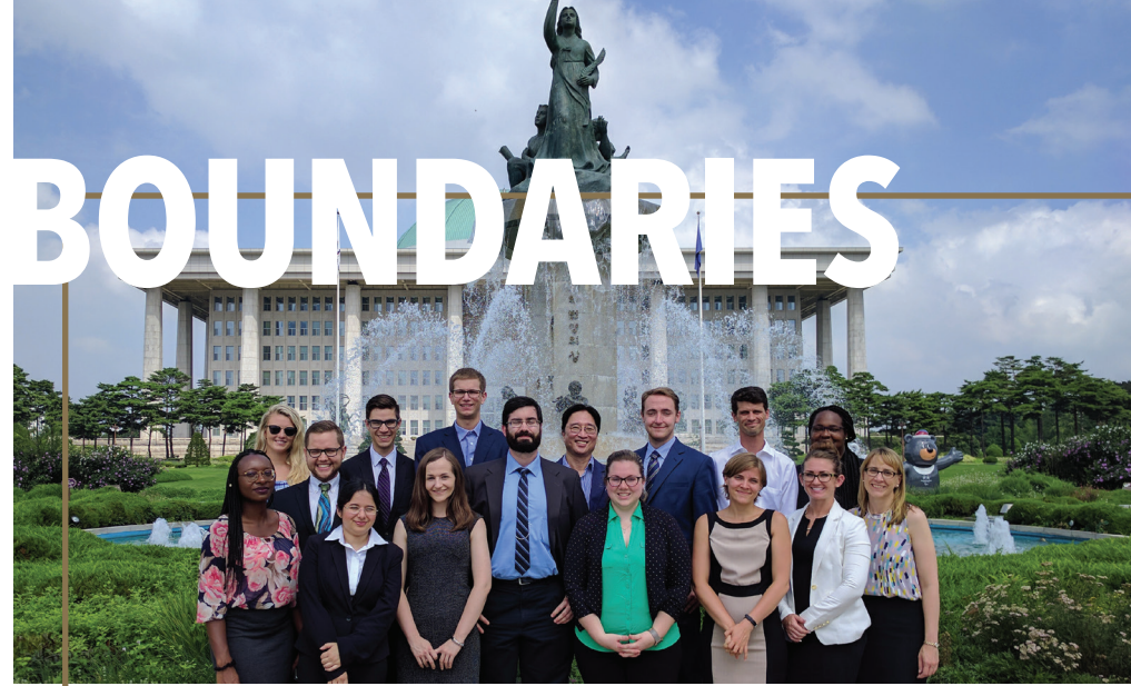
Students in the Williams Honors College joined others from the School of Law on a trip to Japan to learn about international law.

Beginning the spring semester of your freshman year, priority registration ensures that you will have the earliest selection of