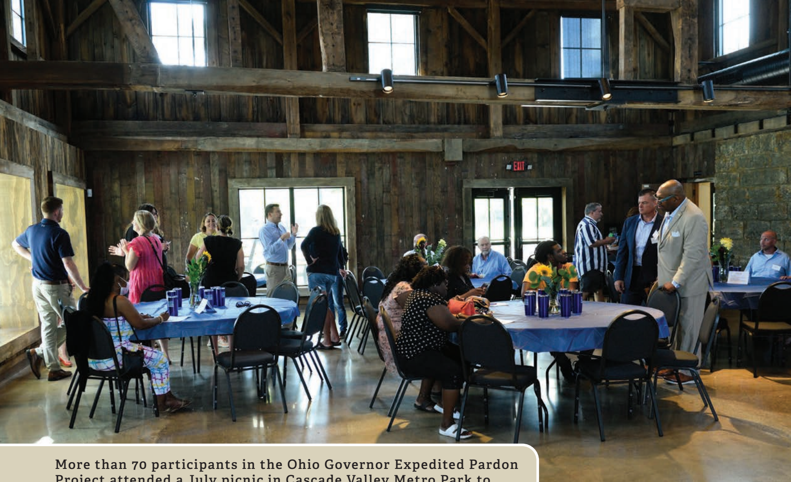
More than 70 participants in the Ohio Governor Expedited Pardon Project attended a July picnic in Cascade Valley Metro Park to celebrate the first 37 people to receive pardons.