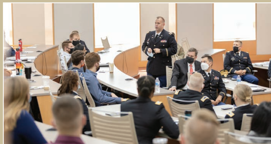
ARMY COURT OF CRIMINAL APPEALS