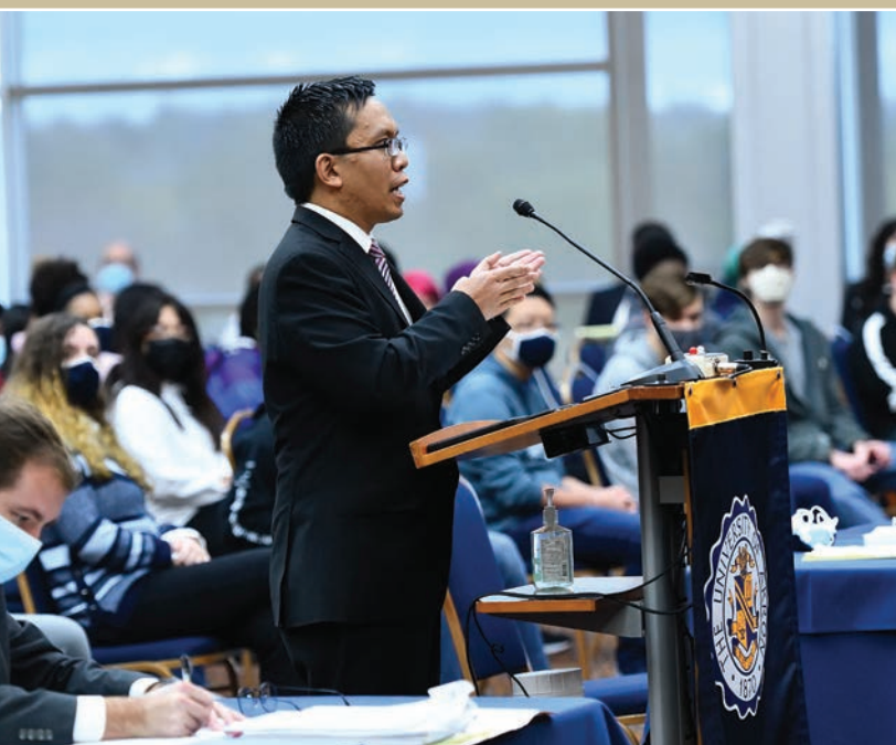
OHIO SUPREME COURT OFF-SITE COURT PROGRAM