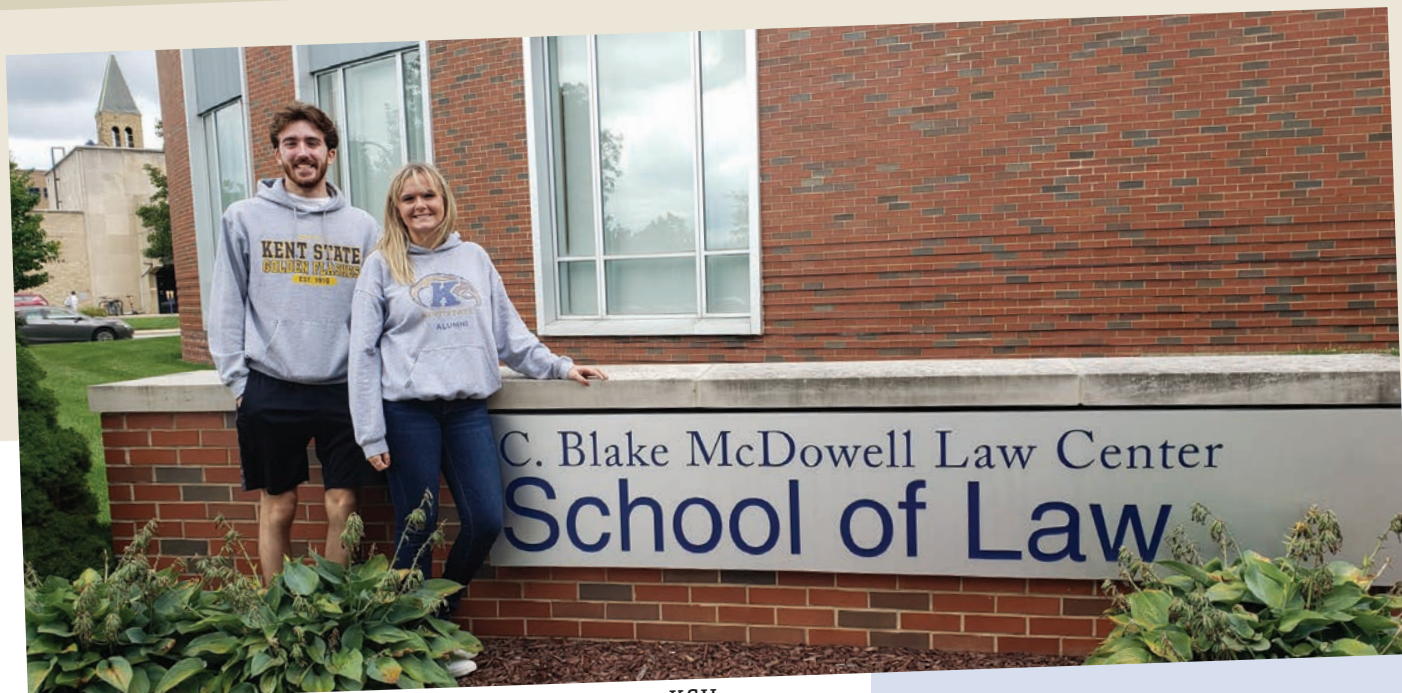
The 3+3 collaboration with Kent State may mean more KSU sweatshirts around the School of Law.